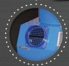
COOL AIR NOZZLES CAN BE REPLACED WITH INCLUDED GRILL