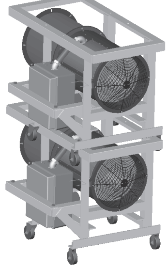
Two SDRA-RG Stacked